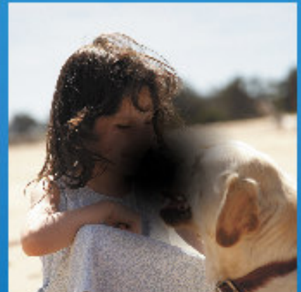
Age-related Macular Degeneration

We offer the following FREE services across Victoria through domiciliary or residential training: