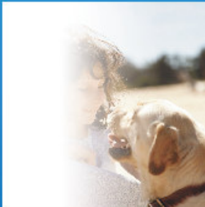
Field Loss from Acquired Brain Injury